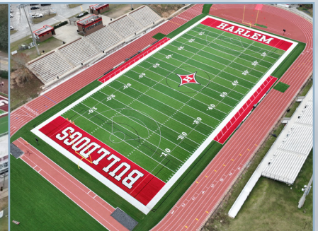
Harlem High School