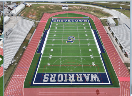
Greentown High School