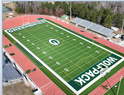
Greenbriar High School