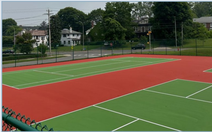
Nottingham Tennis Court, Lincoln Tennis and Pickleball Court