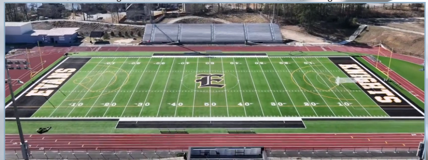
Evans High School